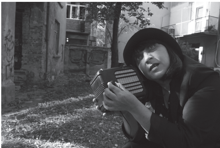
A Small Radio